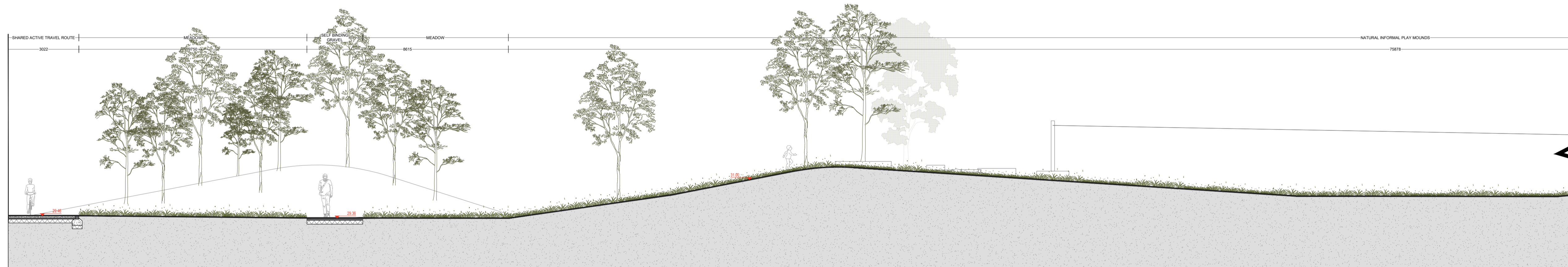
SECTION 15 SCALE: 1:100 @ A1