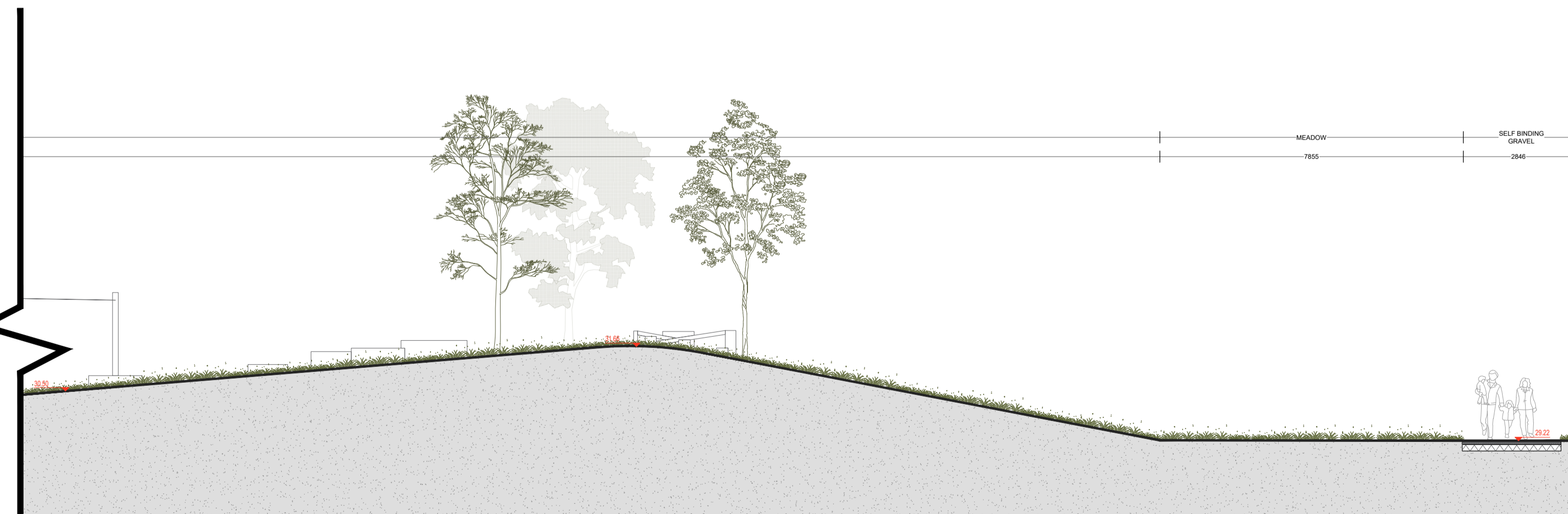
SECTION 15 SCALE: 1:100 @ A1